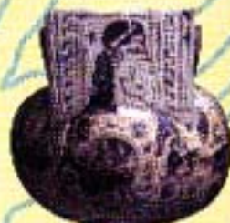
Aryballois with frieze of infantrymen and cavalry; woman's head on handle 600-575 B.C.