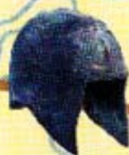
Illyrian helmet 7th c. B.C.