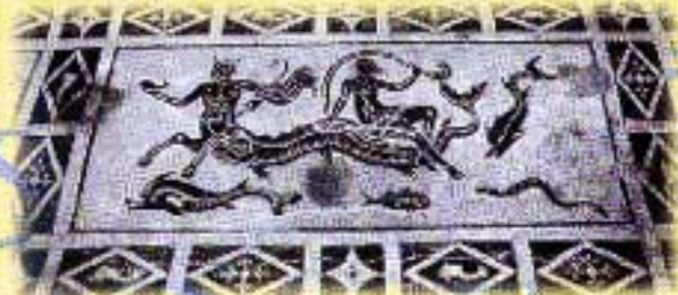
Mosaic from the Roman Bath Mid 2nd c. A.D.