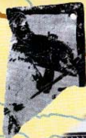
Poseidon carrying dolphin and trident: votive plaque 6th c. B.C.