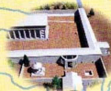
Temple of Poseidon (upper left) and Sanctuary of Palaion (foreground) in the late 2nd c. A.D.