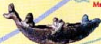
Bronze boat with oarsmen 6th c. B.C.