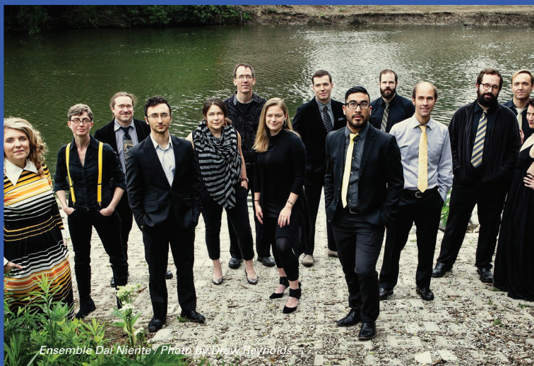
Ensemble Dal Niente

04.09.17 SUN | 3:00 PM LOGAN CENTER PERFORMANCE HALL