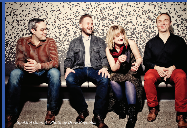
Spektral Quartet / Photo by Drew Reynolds

05.05.17 FRI | 7:30 PM LOGAN CENTER PERFORMANCE HALL