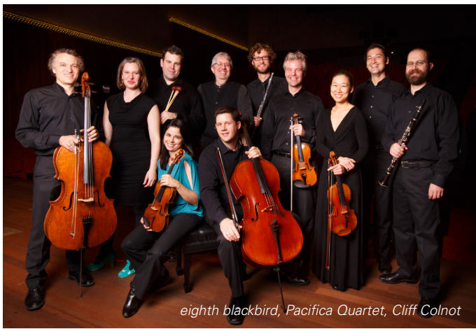
eighth blackbird, Pacifica Quartet, Cliff Colnot